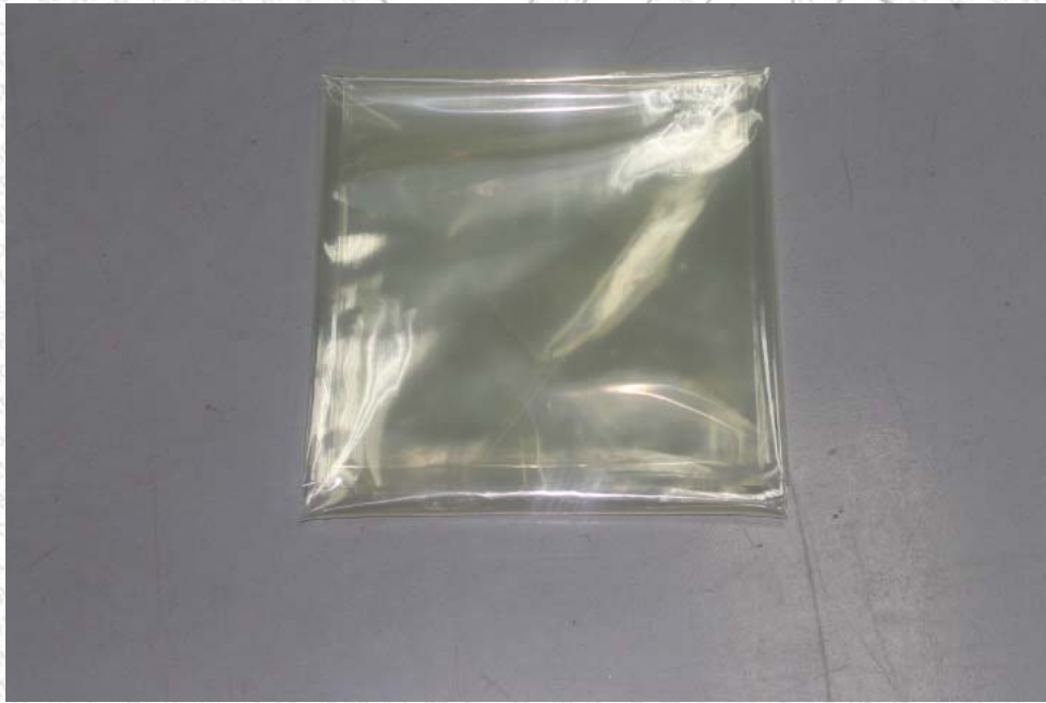
Disposable Bag For Biotechnology