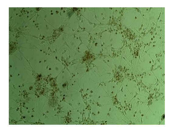
Figure 2. The ScienCell<sup>TM</sup> Colorimetric TUNEL Apoptosis Assay is applied to rat cortical neurons cultured with ScienCell<sup>TM</sup> Neuronal Medium for 3 days, and apoptotic cells can be identified with dark brown nucleus.

Figure 1. The ScienCell<sup>™</sup> Colorimetric TUNEL Apoptosis Assay is applied to human astrocytes treated with (A) and without (B) DNase I, and data shows that dark brown nuclei can only be observed in those cells treated with DNase I.