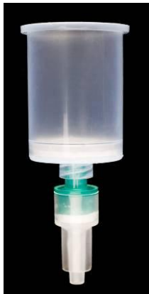
Zymo-Spin™ V-E Column w/ Zymo-Midi Filter™

For processing, simply add the specially formulated Genomic Lysis Buffer to a sample, vortex, and transfer the mixture to the supplied Zymo-Spin™ Column w/ Zymo-Midi Filter™ . There is no need for organic denaturants or Proteinase K digestion because of the unique chemistries featured in the kit. Instead, the product features Fast-Spin technology to yield high-quality, purified DNA in just minutes (see below). PCR inhibitors are effectively removed during the purification process. DNA purified using the Quick-gDNA™ Blood MidiPrep is suitable for PCR, nucleotide blotting, DNA sequencing, restriction endonuclease digestion, bisulfite conversion/methylation analysis, and other downstream applications.